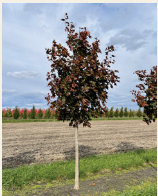
Acer truncatum x A. platanoides 'JFS-KW202' | Crimson Sunset Shantung Maple 2.0-4.0"

Acer tataricum 'GarAnn' - The Hot Wings Maple shows off in the summer when the bright red fruits pop against the light green leaves. The tree also has white flower clusters in May. As a small to medium tree, the Hot Wings Maple is very versatile in the landscape.