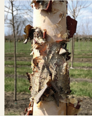
Betula nigra | River Birch 8-16' & 2.0-4.0"

Asimina triloba - Pawpaw, is a small deciduous tree native to North America, prized for its large, tropical-looking leaves and unique, custard-like fruits with a sweet banana-mango flavor. In spring, it features deep purple, bell-shaped flowers making it an attractive and productive addition to gardens and landscapes.