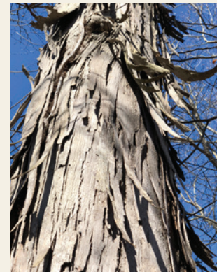
Carya ovata | Shagbark Hickory 🍷 2.0-4.0"

Height: 75' | Spread: 55' | Shape: Oval | Growth Rate: Slow Foliage: Green | Fall Color: Yellow-Brown | Flower: Insignificant Fruit: Showy Edible Nut | Distinctive Features: Ornamental bark with edible nuts