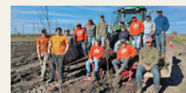
SGN Field Crew Core group of local and H2A employees who make the magic happen