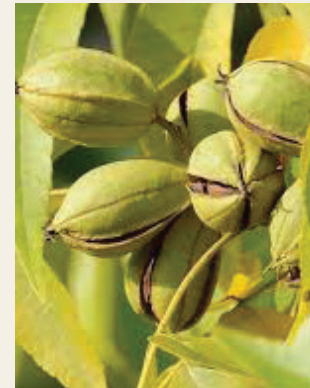
Carya illinoensis | Hardy Pecan 🍷 2.0-4.0"