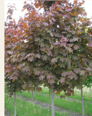
Acer platanoides 'Deborah' | Deborah Norway Maple 2.0-4.0"

Height: 45' | Spread: 40' | Shape: Rounded | Growth Rate: Medium to Fast Foliage: Maroon in Spring, Dark Green in Summer | Fall Color: Bronze Flower: Greenish-Yellow, Insignificant | Fruit: Samara, Insignificant Distinctive Features: Colorful changing foliage in all seasons