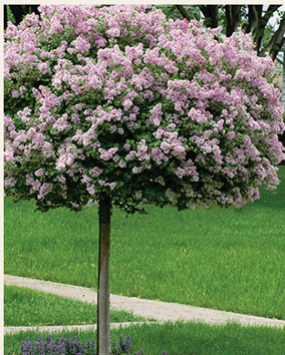
Syringa meyeri 'Palibin' | Dwarf Korean Lilac 2.0-4.0"

Sassafras albidum - Sassafras is an aromatic, deciduous flowering tree with uniquely green shaped leaves that transform into vivid shades of yellow, orange, and red in the fall. In early spring, male and female trees display small, bright yellow-green flower clusters - with females producing blue drupes - making this versatile tree ideal for naturalized areas, screens, or as a shade tree in well-drained, sandy soils.