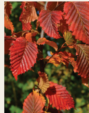
Carpinus betulus 'Rockhampton Red' | Rockhampton Red European Hornbeam 2.0-4.0"

Height: 50' | Spread: 40' | Shape: Pyramidal | Growth Rate: Medium Foliage: Bright Green | Fall Color: Red orange | Flower: Green Catkins Fruit: Winged Fruit | Distinctive Features: Beautiful fall color