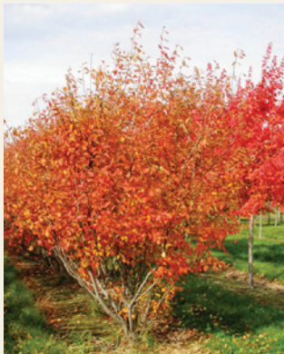
Amelanchier x grandiflora 'Autumn Brilliance' Autumn Brilliance Serviceberry 6'-10' & 2.0"-3.0"

Amelanchier laevis 'Lustre' - Allegheny Serviceberry is a native woodland understory tree with four-season interest. In spring, large showy flowers add a delicate look. Summer offers edible blue-black berries, followed by an excellent fall color.