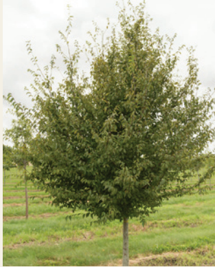
Carpinus caroliniana | American Hornbeam 🍷 2.0-4.0"

Height: 25' | Spread: 20' | Shape: Oval | Growth Rate: Slow to Medium Foliage: Green | Fall Color: Orange-Red | Flower: Male Flowers in Catkins 1-2" Long | Fruit: Nutlets | Distinctive Features: Fantastic fall color highlighted by smooth, gray bark