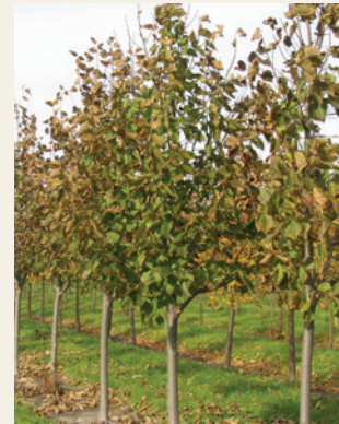
Tilia americana 'Redmond' | Redmond American Linden 🌿 2.0-4.0"

Height: 35' | Spread: 25' | Shape: Densely Pyramidal | Growth Rate: Medium Foliage: Green | Fall Color: Yellow | Flower: Pale Yellow, Fragrant | Fruit: Nutlet Distinctive Features: Large leaves and formal shape