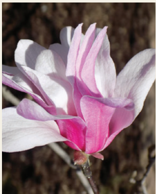
Magnolia x loebneri 'Leonard Messel' | Leonard Messel Magnolia 4'-10'

Magnolia acuminata 'Butterflies' – Butterflies Magnolia is one of the best Magnolias. The outstanding yellow spring flowers are 4-5" in size, making this an excellent small tree in the landscape!