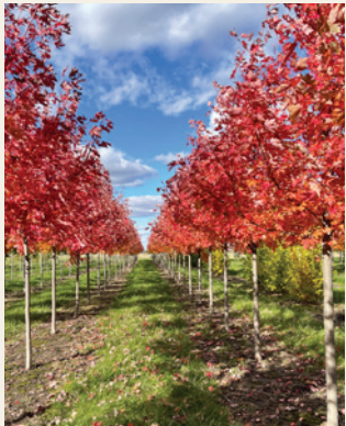
Acer x freemanii 'Jeffersred' | Autumn Blaze Maple 2.0-4.0"

Acer x freemanii 'DTR-102' - The Autumn Fantasy Maple is a hybrid of the Silver and Red maple that consistently produces a vibrant red fall color. Its broad, oval shape is highlighted by bright green spring and summer foliage.