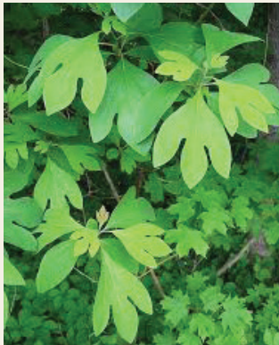
Sassafras albidum | Sassafras 2.0-4.0"

Salix alba 'Tristis' - This graceful Weeping Willow is fast growing and tough. It's winter stems show off a golden color, and it is a widely adaptable tree.