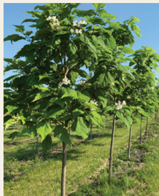
Catalpa speciosa 'Hiawatha 2' | Heartland Northern Catalpa 🌿 🌿 2.0-4.0"

GROWER'S NOTE: Growing Catalpas can be challenging. They come to us as young whips without any branching. They quickly put on caliper, so we have to stay vigilant on pruning them in the first few years. Usually by the second season, they have already grown enough to be harvested and sold. We like the Northern Catalpa because it is a challenge to grow and yields a quick reward. Growing this Midwest native keeps our job interesting!