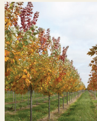
Acer x freemanii 'Celzam' | Celebration Maple 🍂 2.0-4.0"

Acer x freemanii 'Baliston' - Matador Maple, a new variety from Bailey Nurseries' First Editions program, is a superior shade tree with upright form and symmetrical branching. It turns a deeper red in the fall than Autumn