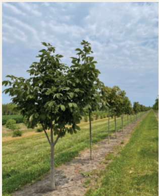
Aesculus flava | Yellow Buckeye 2.0-4.0"

Acer x freemanii 'Jeffersred' - The Autumn Blaze Maple is a hybrid of the Silver and Red Maple. This popular tree is fast growing and hardy, turning a bright red in the fall.