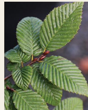
Carpinus betulus 'Lucas' | Lucas European Hornbeam 2.0-4.0"

Carpinus betulus 'JFS-KWICB' - The Emerald Avenue Hornbeam is well suited for heat tolerance with a strong structure and central leader. A sturdy "grower friendly tree" that is easy to grow, this tree was developed by J. Frank Schmidt Nursery to fill the need for a clean, narrow, mid-sized tree in the landscape.