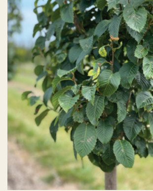
Carpinus betulus 'JFS-KWICB' | Emerald Avenue Hornbeam 2.0-4.0"

Height: 40' | Spread: 28' | Shape: Pyramidal to Oval | Growth Rate: Medium Foliage: Dark Green | Fall Color: Yellow | Flower: Catkins Fruit: Nutlet | Distinctive Features: Healthy looking deep green leaves