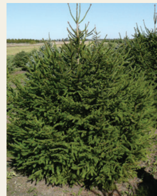
Picea abies | Norway Spruce 4'-8'

815.448.2097 | WWW.SPRINGGROVENURSERY.COM