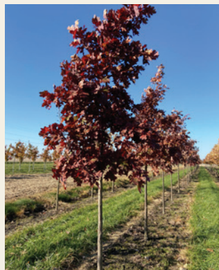
Quercus alba | White Oak 🍂 2.0-4.0"

Height: 60' | Spread: 60' | Shape: Rounded | Growth Rate: Medium Foliage: Green | Fall Color: Deep Red | Flower: Catkin, Insignificant Fruit: 3/4"-1" Acorn | Distinctive Features: Majestic shbaldade tree, one of the nicest Oaks and the state tree of Illinois