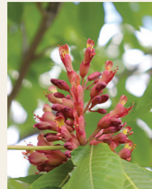
Aesculus x bushii 'Aaron #1' | Mystic Ruby Buckeye 2.0-4.0"

Aesculus x arnoldiana 'Autumn Splendor' - The Autumn Splendor Horsechestnut was developed at the University of Minnesota Landscape Arboretum. It is a hybrid of A. glabra crossed with flava & pavia. The late spring flowers are a stunning 6" long. The foliage has great scorch resistance with a deep red fall color. Brown fruits also adorn the tree.