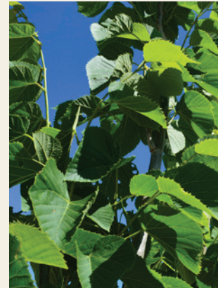
Tilia americana 'McKSentry' | American Sentry Linden 🌿 2.0-4.0"

Height: 40' | Spread: 25' | Shape: Densely Pyramidal | Growth Rate: Medium Foliage: Green | Fall Color: Yellow | Flower: Pale Yellow, Fragrant Fruit: Nutlet | Distinctive Features: Distinctive silvery bark