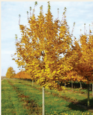
Acer miyabei 'Morton' | State Street Maple 🌿 2.0-4.0"

Acer ginnala 'Ruby Slippers' – Ruby Slippers Amur Maple was selected for its uniform shape and size, with bright red fruits in early summer. Ruby Slippers finishes the season with a bright red fall color.