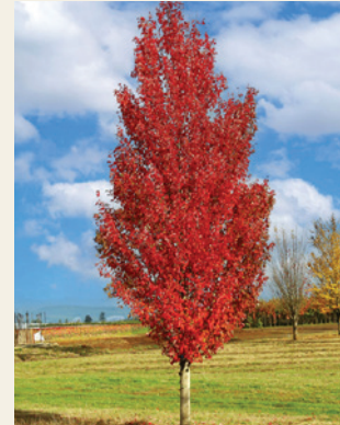
Acer rubrum 'WW Warren' | Red Sentinel Maple 🍁 2.0-4.0"

Height: 40' | Spread: 18' | Shape: Tightly fastigiate | Growth Rate: Medium Foliage: Green | Fall Color: Red | Flower: Red, Small Fruit: Samara | Distinctive Features: Vibrant fall color