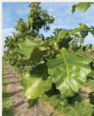
Quercus bicolor | Swamp White Oak 🍂 2.0-4.0"