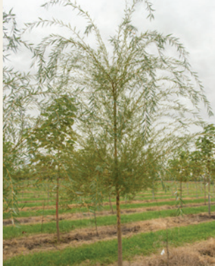
Salix alba 'Tristis' | Weeping Willow 2.0-4.0"

Height: 40' | Spread: 60' | Shape: Broadly Weeping | Growth Rate: Fast Foliage: Bright Green | Fall Color: Yellow | Flower: Catkin, Insignificant Fruit: Capsule, Insignificant | Distinctive Features: Graceful weeping branches with golden tones