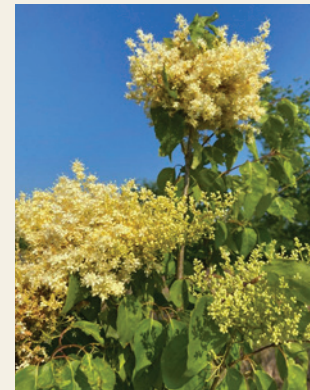
Syringa pekinensis 'Zhang Zhiming' | Beijing Gold Peking Tree Lilac 2.0-4.0"

Height: 20' | Spread: 15' | Shape: Upright spreading Growth Rate: Medium | Foliage: Dark Green | Fall Color: Insignificant Flower: Creamy-White, Fragrant Panicles 6-12" Long | Fruit: Fruitless Distinctive Features: Fragrant, creamy-yellow spring flowers