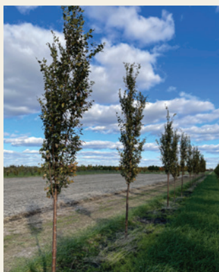
Zelkova serrata 'Musashino' | Musashino Japanese Zelkova 2.0-4.0"

GROWER'S NOTE: Triumph Elm matures to a beautiful tree, but at a young age in the nursery it takes a lot of work to get it to that point. Patience and consistency are necessary in growing any Elm, especially Triumph. This variety responds well to staking as long as you pay attention to it and stay ahead of its new growth.