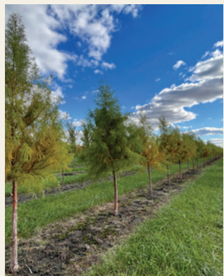
Taxodium distichum 'Mickelson' | Shawnee Brave Bald Cypress 🌿 2.0-4.0"

Height: 55' | Spread: 15' | Shape: Pyramidal | Growth Rate: Fast Foliage: Green, Deciduous Conifer | Fall Color: Orange-Brown Flower: Insignificant | Fruit: 1" Cones Distinctive Features: Narrow form with interesting foliage