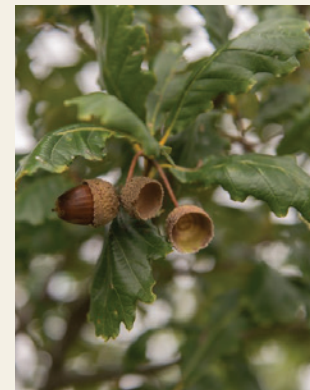
Betula nigra 'Cully' | Heritage River Birch 8-16' & 2.0-4.0"

Betula nigra - The River Birch is an excellent tree showcasing reddish-brown peeling bark and an outstanding yellow fall color. As a quick grower, this tree delivers shade and ornamental interest right away!