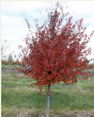
Carpinus caroliniana 'JN Strain' | JN Strain American Hornbeam 🍷 2.0-4.0"

Carpinus caroliniana 'JN Select A' - The Fire King American Hornbeam, a Mike Yanny introduction from Johnson's Nursery, has outstanding orange-red fall color and is an excellent choice for tight areas. It can grow in full sun to full shade and offers habitat from it's seeds and catkins.