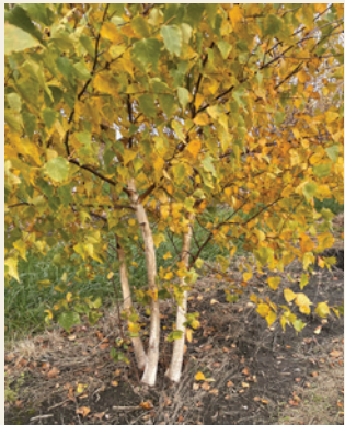
Betula populifolia 'Whitespire' | Whitespire Birch 2.0-4.0"

Betula platyphylla 'Fargo' - The Dakota Pinnacle Birch was developed by North Dakota State University. It is very tolerant of heat and drought and is Japanese Beetle resistant. The bark is yellow-white and is slightly exfoliating with the dark green foliage turning a brilliant yellow in the fall.