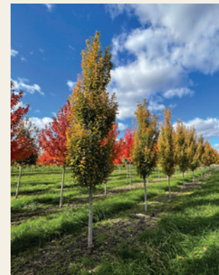
Acer rubrum 'Armstrong Gold' | Armstrong Gold Red Maple 🌿 2.0-4.0"

Acer platanoides 'Pond' – The Emerald Lustre Norway Maple is a great shade tree for a variety of uses. The quick growth makes it an excellent choice where you need shade fast, as the large green leaves cast a dense shade underneath. The bright yellow fall color really pops in the landscape.