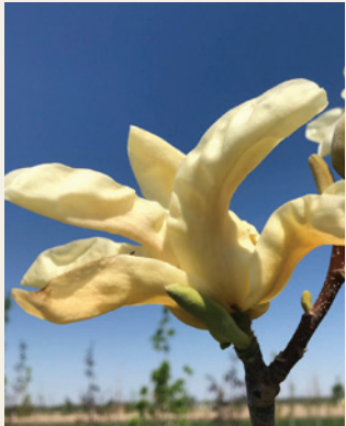
Magnolia acuminata 'Butterflies' | Butterflies Magnolia 4'-10'

Maclura pomifera 'White Shield' - White Shield Osage Orange is tough as nails. This genus can thrive in areas most trees cannot and was developed at J. Frank Schmidt Nursery. The glossy green foliage turns yellow in the fall. Unlike the genus, this cultivar does not bear fruit or thorns.