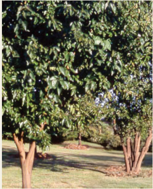
Maclura pomifera 'White Shield' | White Shield Osage Orange 🍷 2.0-4.0'

Height: 35' | Spread: 35' | Shape: Upright Spreading | Growth Rate: Fast Foliage: Dark Green, Glossy | Fall Color: Yellow | Flower: Insignificant Fruit: Fruitless | Distinctive Features: Tough and adaptable