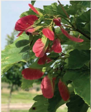
Acer tataricum 'GarAnn' | Hot Wings Maple 2.0-4.0"

Acer saccharum 'Morton' - Crescendo Sugar Maple was selected by the Chicagoland Grows program and developed at the Morton Arboretum. Crescendo features heat resistant foliage and spectacular orange fall color.