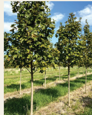
Acer saccharum 'Green Mountain' | Green Mountain Sugar Maple 🍁🍂 2.0-4.0"

GROWER'S NOTE: Fall Fiesta is one of our favorite Sugar Maple varieties because it has a consistent fall color and good branching structure. We have a soft spot in our hearts for Sugar Maples. One of our all-time favorite trees is the mature Sugar Maple in our home backyard!