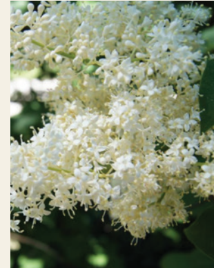
Syringa pekinensis 'WFH2' | Great Wall Japanese Tree Lilac 2.0-4.0"

Syringa pekinensis 'Morton' - Beijing Gold Tree Lilac is a selection from the Chicagoland Grows program that exhibits multiple seasons of interest in the landscape. Grown as either tree form or shrub form, this small ornamental adds beauty all season. Large fragrant yellow blooms cover the tree in spring. The dark green foliage is set apart by the exfoliating cinnamon-brown bark. The fine branching and upright form add additional architecture interest in winter.