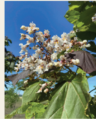
Catalpa x erubescens 'Purpurea' | Purple Catalpa 2.0-4.0"

Catalpa speciosa 'Hiawatha 2' - The Heartland Northern Catalpa was developed by J. Frank Schmidt Nursery. This Northern Catalpa cultivar was selected for its uniform branching, upright form, and darker green leaves. A "grower friendly tree" in the nursery, it makes an excellent addition to parks or city streets.