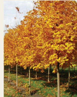
Acer platanoides 'Pond' | Emerald Lustre Norway Maple 2.0-4.0"

Acer platanoides 'Deborah' – The Deborah Norway Maple adds a burst of color in the spring landscape when the leaves emerge reddish-purple. They turn to a dark green in the summer, and the tree provides good shade with its large leaves. The Deborah Maple is a quick grower and a dependable tree in the landscape.