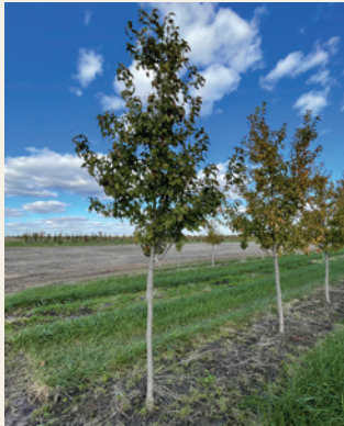
Acer ginnala 'Ruby Slippers' | Ruby Slippers Amur Maple 2.0-4.0"

Acer ginnala 'Flame' – Amur Flame Maple is an excellent specimen tree with a brilliant red fall color. This tree can be planted as an accent or in a small grouping where a small to medium sized tree is needed. The bright red fruits add a unique pop to the summer landscape.