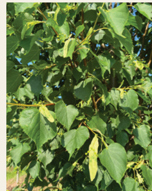
Tilia cordata 'Greenspire' | Greenspire Littleleaf Linden 2.0-4.0"

GROWER'S NOTE: The old-timer nursery saying for Linden is, "They sleep, they creep, they leap!" That's how Lindens tend to grow for us. At a young age they don't appear to be growing much, and next thing you know we have some beautiful specimens filled out and ready to harvest. Pruning Linden branches is like "cutting butter" - they are soft to cut compared to Oaks.