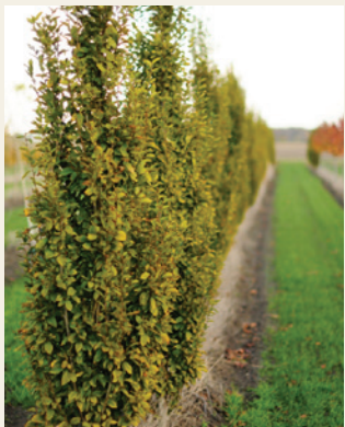
Carpinus betulus 'Fastigiata' | Pyramidal European Hornbeam 2.0-4.0"

Betula populifolia 'Whitespire' - Whitespire Birch is a nice narrow pyramidal size with chalky white bark that looks great all season long. The bright green leaves rustle in the wind and turn the brightest yellow in the fall. Another standout feature are the catkins that grace the tree in the summer.