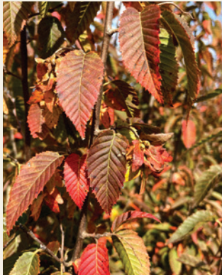
Carpinus caroliniana 'JN Select A' | Fire King American Hornbeam 🍷 2.0-4.0"

GROWER'S NOTE: We feel American Hornbeam is under utilized in the landscape. It is slow to mature but finishes with a flourish and looks great in every season. Nutlets add an interesting texture and rustle in the breeze while its fall color is among some of the best in our nursery!