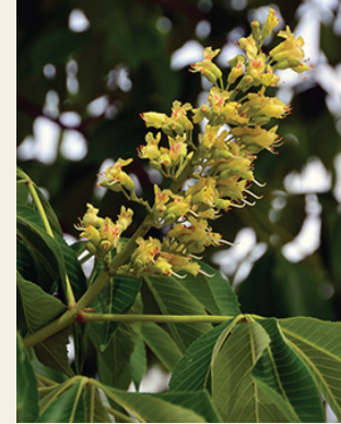
Aesculus glabra 'JN Select' | Early Glow Ohio Buckeye 2.0-4.0"

Height: 35' | Spread: 25' | Shape: Oval, Rounded with Age Growth Rate: Medium | Foliage: Bright Green | Fall Color: Orange-Red Flower: Large Yellow Clusters in Panicles | Fruit: Glossy Brown Nuts Distinctive Features: Chicagoland Grows selection with good disease resistance