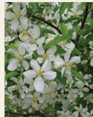
Malus 'Jewelcole' | Red Jewel Crabapple 🍷 4'-10' & 2.0"-4.0'

Malus sargentii 'Select A' - The Firebird Crabapple is compact when young then spreads as it matures. It bursts with white flowers in the spring and red fruits in the fall. It is a Johnson's Nursery introduction.