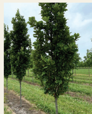
Quercus bicolor 'Bonnie and Mike' | Beacon Oak 🍂 2.0-4.0"

Quercus alba - White Oak is the state tree of Illinois. This majestic native develops a stately appearance. It can tolerate drought and salt, but not flooding.