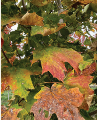
Acer saccharum 'Morton' | Crescendo Sugar Maple 🌿 🍂 2.0-4.0"

Height: 45' | Spread: 40' | Shape: Broadly Round | Growth Rate: Medium Foliage: Dark Green | Fall Color: Orange-Red | Flower: Greenish-Yellow, Insignificant | Fruit: Samara, Insignificant | Distinctive Features: Chicagoland Grows selection with good heat resistance