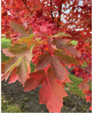
Acer x freemanii 'DTR-102' | Autumn Fantasy Maple 2.0-4.0"

Height: 55' | Spread: 40' | Shape: Broadly Oval | Growth Rate: Fast Foliage: Green | Fall Color: Bright Red | Flower: Red-Yellow, Insignificant Fruit: Samara, Few | Distinctive Features: Deeper red fall color than Autumn Blaze Maple