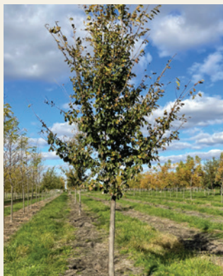
Ulmus japonica x wilsoniana x pumila 'Morton Glossy' | Triumph Elm ✨ 🌱 2.0-4.0"

Height: 55' | Spread: 45' | Shape: Upright Oval | Growth Rate: Fast Foliage: Dark Green, Glossy | Fall Color: Yellow | Flower: Insignificant Fruit: Samaras, Insignificant | Distinctive Features: Chicagoland Grows selection with distinctive upright vase shape