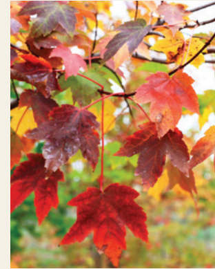
Acer truncatum x A. platanoides 'Warrenred' Pacific Sunset Shantung Maple 2.0-4.0"

Height: 30' | Spread: 25' | Shape: Upright Spreading | Growth Rate: Medium to Fast | Foliage: Dark Green, Glossy | Fall Color: Orange-Red Flower: Greenish-Yellow, Insignificant | Fruit: Samara, Insignificant Distinctive Features: Glossy green leaves all summer turn to a colorful fall display