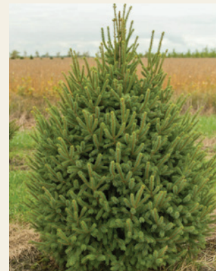
Picea glauca 'Densata' | Black Hills Spruce 4'-8'

GROWER'S NOTE: This is Jamie's favorite evergreen to grow because it's clean and uniform. The needles make for soft and easy pruning. It doesn't grow too fast or too slow - it's just right!