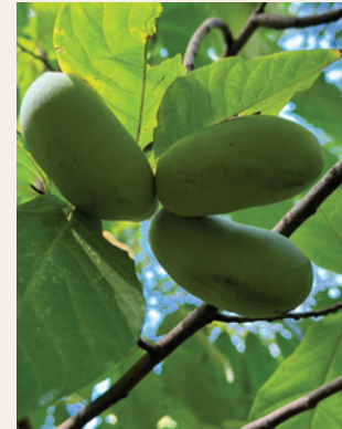
Asimina triloba | Pawpaw 6'-10' & 2.0"-3.0"

Height: 25' | Spread: 25' | Shape: Broad rounded | Growth Rate: Medium Foliage: Green | Fall Color: Bright yellow | Flower: Purple Fruit: 4"-6" edible fruits | Distinctive Features: Native edible fruit that ripens in early summer