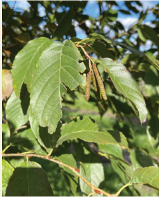
Alnus x spaethii | Spaeth's Alder 2.0-4.0"

Height: 55' | Spread: 20' | Shape: Broadly Pyramidal | Growth Rate: Fast Foliage: Purple in Spring, Glossy Green in Summer | Fall Color: Yellow Flower: Male Flowers in Catkins 2-3" Long | Fruit: Cone-like Structures Distinctive Features: Glossy leaves, extremely tough and adaptable