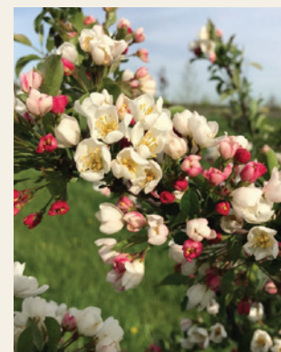
Malus 'Firebird' | Firebird Crabapple 🍷 2.0-4.0'

Magnolia x loebneri 'Merrill' - Dr. Merrill Magnolia is covered in white flowers in early spring. It is a dependable Magnolia for the landscape.