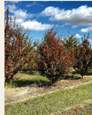
Carpinus caroliniana 'JN Upright' | Firespire American Hornbeam 🍷 2.0-4.0"

Height: 20' | Spread: 10' | Shape: Narrow, Upright | Growth Rate: Medium Foliage: Green | Fall Color: Orange-Red | Flower: Male Flowers in Catkins 1-2" Long | Fruit: Nutlets | Distinctive Features: Fantastic fall color highlighted by smooth, gray bark and tight form