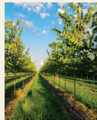
Celtis occidentalis | Common Hackberry 🌿 🌿 2.0-4.0"

Catalpa x erubescens 'Purpurea' - The Purple Catalpa leafs out in the spring with beautiful purple-black new growth. Large white flowers are showy in late summer as the foliage transitions to a dark bronze-green.