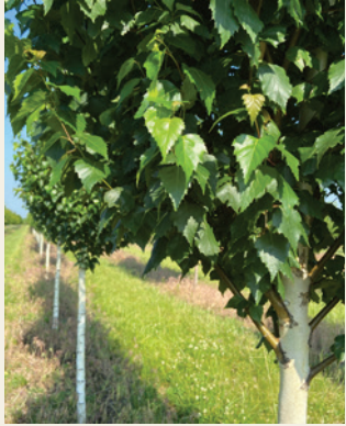
Betula platyphylla 'Fargo' | Dakota Pinnacle Birch 2.0-4.0"

Height: 35' | Spread: 15' | Shape: Upright Pyramidal | Growth Rate: Medium to Fast | Foliage: Dark Green | Fall Color: Bright Yellow | Flower: Catkins Fruit: Nutlet | Distinctive Features: White exfoliating bark contrasts with dark green leaves