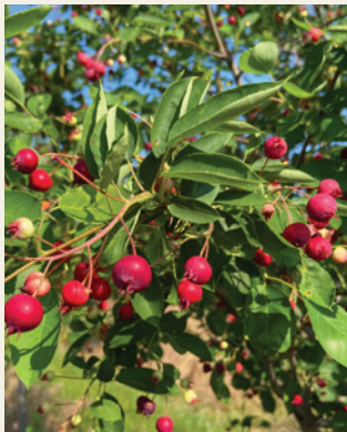
Amelanchier laevis 'Lustre' | Lustre Allegheny Serviceberry 2.0-4.0"

Alnus x spaethii - Spaeth's Alder is a fantastic street tree with lustrous green foliage. It fills in well as an Ash alternative and is wind, salt, and pollution tolerant. The tree is widely used in Europe and named after botanist Franz Spath from Berlin, Germany.