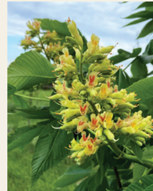
Aesculus x arnoldiana 'Autumn Splendor' Autumn Splendor Horsechestnut 2.0-4.0"

Aesculus glabra 'JN Select' - Early Glow Ohio Buckeye is a Chicagoland Grows introduction and is an excellent small to medium shade tree for use in our landscape. With multi-season interest, this native offers adaptability, texture, and beauty.