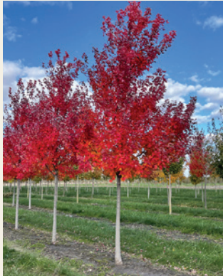
Acer rubrum 'Frank Jr' | Redpointe Red Maple 🍁🍂 2.0-4.0"

Height: 45' | Spread: 30' | Shape: Broadly Oval | Growth Rate: Medium to Fast Foliage: Dark Green | Fall Color: Bright Red | Flower: Red, Small Fruit: Samara, Insignificant | Distinctive Features: Excellent Red Maple for color & vigor