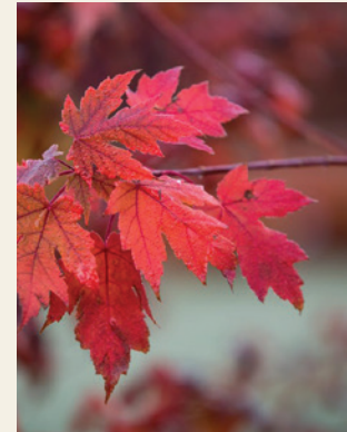
Acer x freemanii 'Baliston' | Matador Maple 🍂 2.0-4.0"

Acer truncatum x A. platanoides 'Warrenred' - The Pacific Sunset Shantung Maple is another great J.Frank Schmidt Nursery introduction. This hybrid Maple brings the best of 2 trees – the Shantung and Norway Maples. The outstanding glossy green foliage turns magnificent shades of yellow, orange, and red in the fall. The small-medium size of the tree makes it an excellent choice for the landscape and wins our "Tried & True" status!