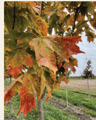
Acer saccharum 'Bailsta' | Fall Fiesta Sugar Maple 🍁🍂 2.0-4.0"

Height: 50' | Spread: 30' | Shape: Broadly Round | Growth Rate: Medium to Fast Foliage: Dark Green | Fall Color: Orange, Red, and Yellow Flower: Greenish-Yellow, Insignificant | Fruit: Samara, Insignificant Distinctive Features: Mix of colors in the fall