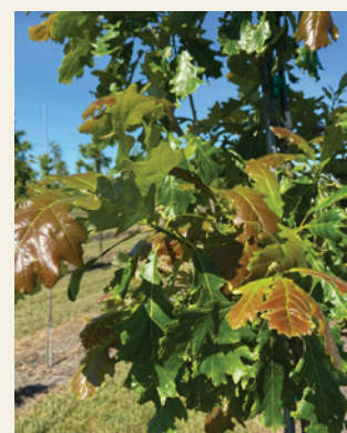
Quercus bicolor 'JFS-KW12' | American Dream Oak 🍂 2.0-4.0"

GROWER'S NOTE: This Oak responds well to pruning & staking in the nursery. Out of all of the Oaks we grow, we work on Swamp White Oaks the most. As a young tree, it requires lots of staking, un-staking, and sometimes even staking again. But in the end, it always finishes strong and results in a beautiful specimen (unless it's still being stubborn- then you just need to be a little more patient!)