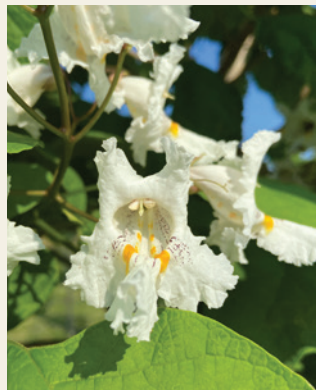
Catalpa speciosa | Northern Catalpa 🌿 🌿 2.0-4.0"

Height: 50' | Spread: 40' | Shape: Oval Rounded | Growth Rate: Fast Foliage: Green | Fall Color: Yellow | Flower: White Clusters | Fruit: Long Pods Distinctive Features: Large heart-shaped leaves with showy white flowers