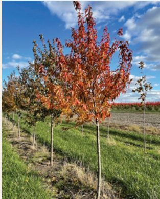
Acer ginnala 'Flame' | Amur Flame Maple 2.0-4.0"

Height: 20' | Spread: 20' | Shape: Compact, Round | Growth Rate: Medium Foliage: Bright Green | Fall Color: Orange-Red to Deep Red Flower: Yellowish-White Fragrant Panicles | Fruit: Bright Red Samaras Distinctive Features: Bright red fall color