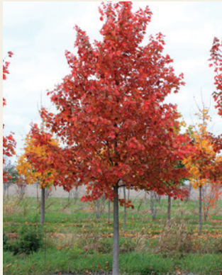
Acer rubrum 'Sun Valley' | Sun Valley Red Maple 🍁🍂 2.0-4.0"

GROWER'S NOTE: Redpointe is our favorite Red Maple variety. It grows fast in our fields, but it doesn't get too "leggy". The foliage stays dark green all summer and doesn't seem to yellow like other A. rubrum varieties. We rarely have any bark splitting issues and generally bring 100% of what we plant to market quickly. The red fall color is outstanding.